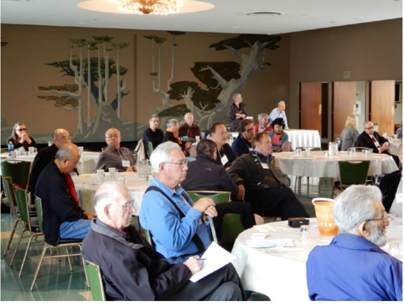
Beautiful Scottish Rite interior room in which first RECCSF general membership meeting was held at new location.